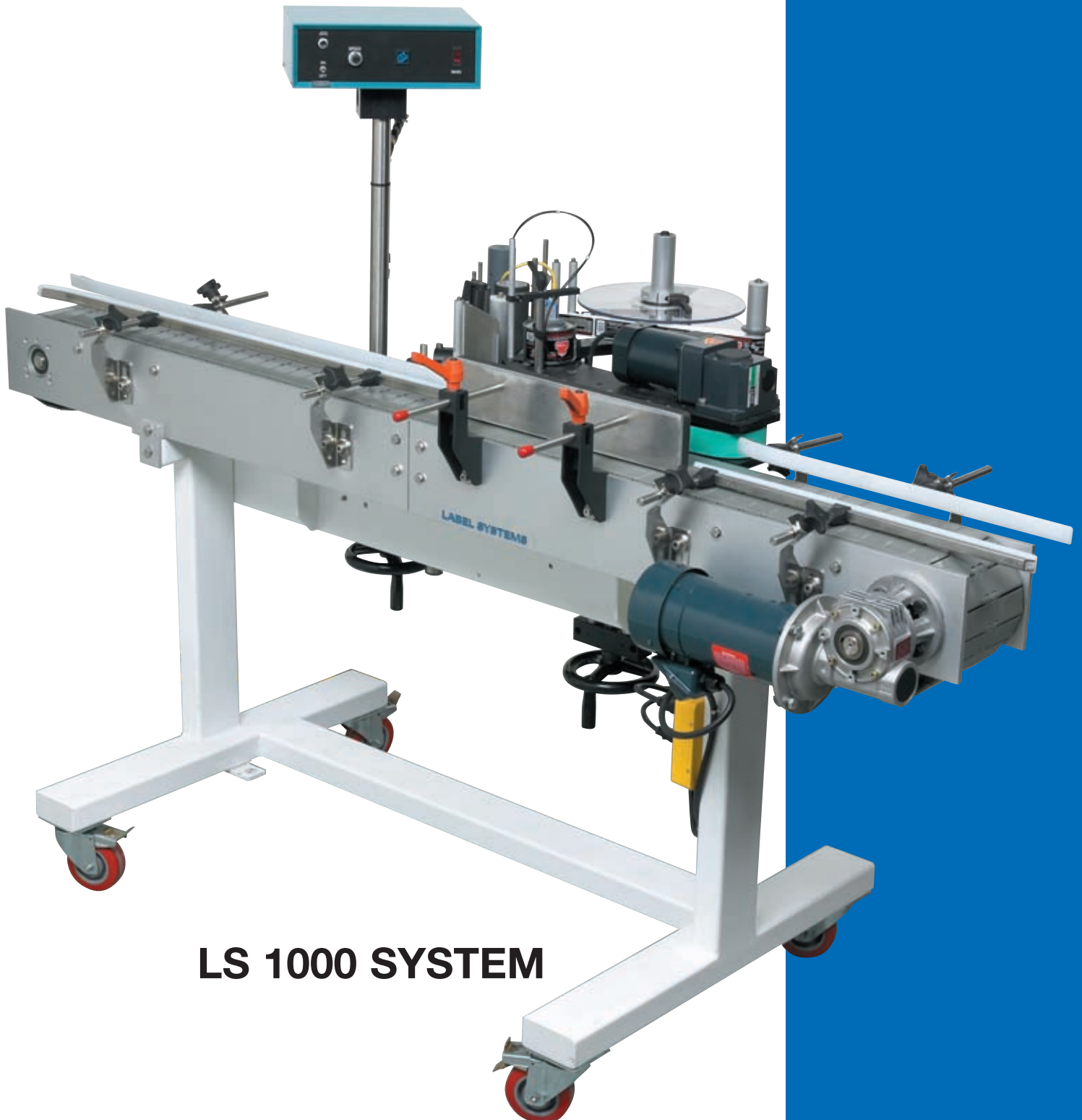
LS 1000 SYSTEM